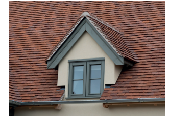
CLAY ROOF TILES