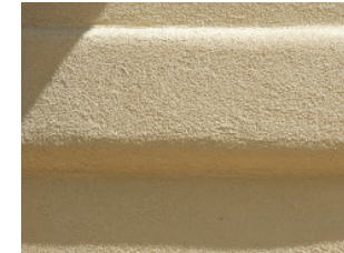
NATURAL COLOURED RENDER