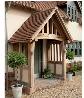
BORDER OAK PORCH