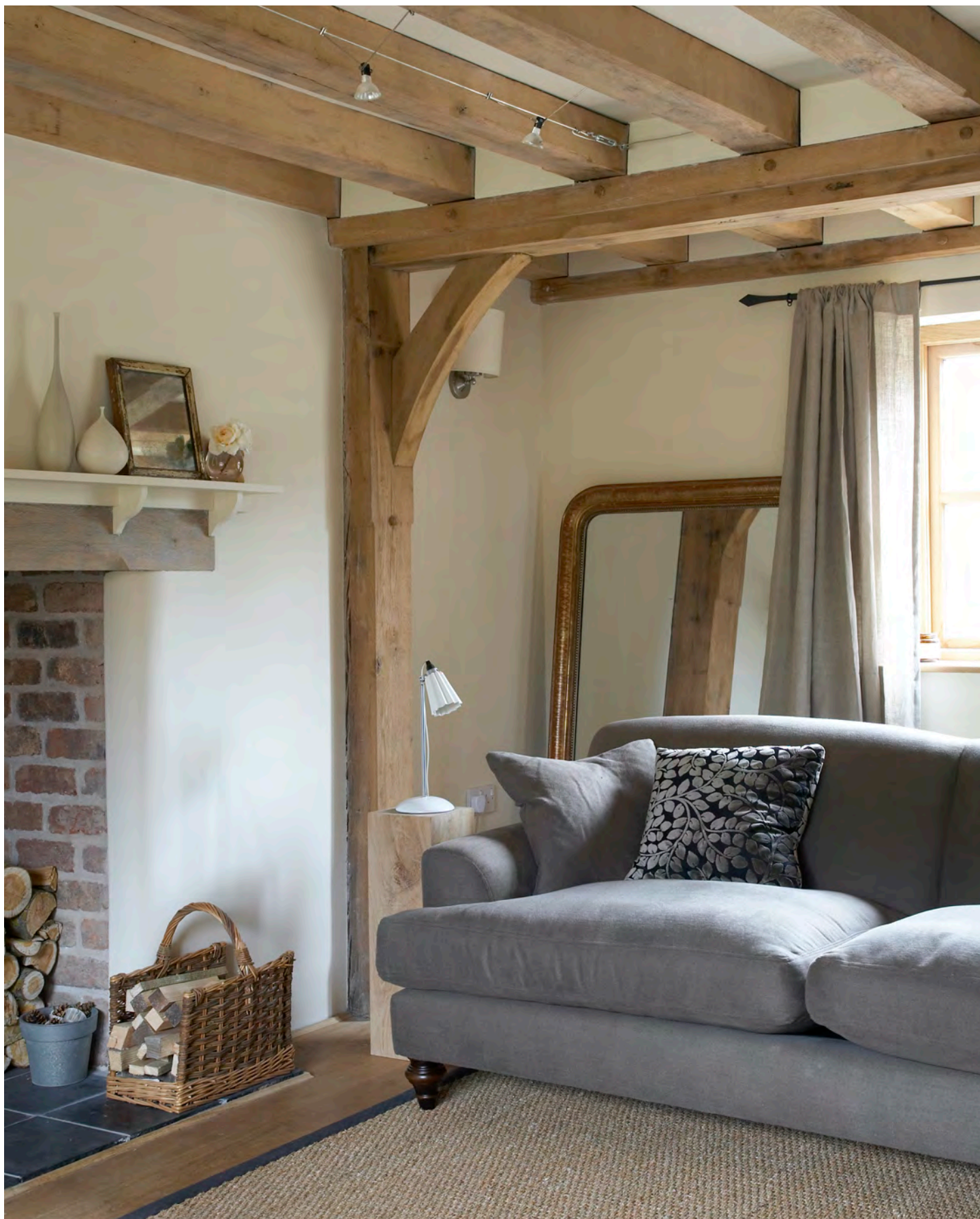
PEARMAN COTTAGE IS NAMED AFTER THE WORCESTER PEARMAIN APPLE ORIGINATING FROM HEREFORDSHIRE AND WORCESTERSHIRE IN 1870'S. IT HAS AN ORIGINAL AND DISTINCT FLAVOUR.